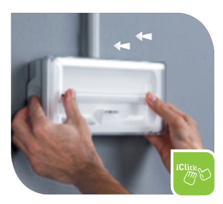
Product snaps shut.