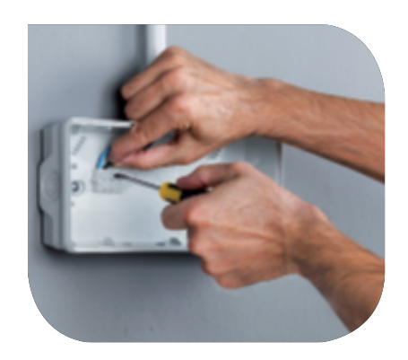
Ample space for cable handling and storage. Connected via 2 x 2.5 \ \text{mm}^2 screw terminals.

Particularly suitable for: Sports grounds, external staircases, garages, industrial premises, swimming pools.