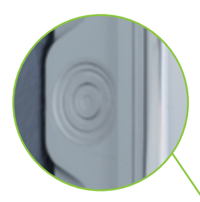
Flexible cable entries.

Manufactured in accordance with International and European standards: IEC and EN 60598-2-22.