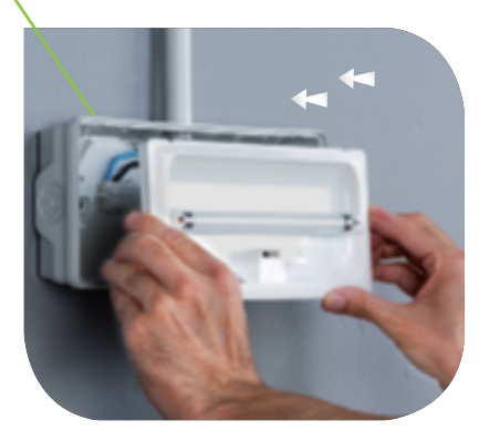
On completing work, plug the reflector into the base.